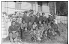
Indian children attending the Horn Bay Mission School, April May, BC, 1909